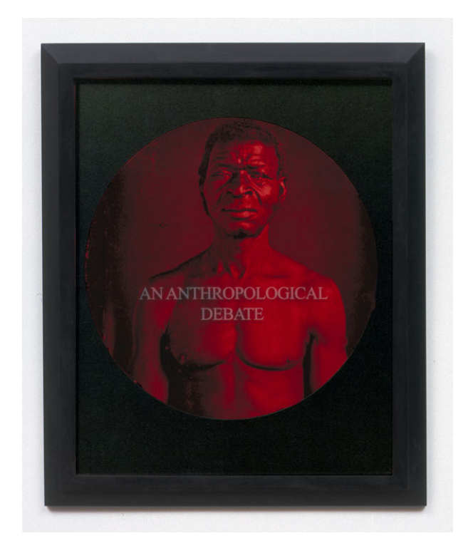
Figure 8 Carrie Mae Weems, An Anthropological Debate, 1995–96, C-print with sandblasted text on glass, 26 1/2 x 22 3/4 inches. ©Carrie Mae Weems. Courtesy of the artist and Jack Shainman Gallery, New York. [Colour figure can be viewed at wileyonlinelibrary.com].

scientific profile / a negroid type / an anthropological debate / and a photographic subject." "You" in this sentence, insofar as it speaks on behalf of the people depicted, revitalizes these subjects by giving voice to those who had no voices in the moments the photographs were taken and bears witness to the injustices inflicted on them. In this way Weems tries to sublimate (in Oliver's sense of the term) on their behalf by inserting their voice into the social realm. The sentence does not read "He became an anthropological debate" or "she became a photographic subject" or "they became negroid types" in the distant third person; rather, as the viewer reads the words her interior voice speaks to the person whom she sees before her. Thus the viewer performs the restoration of subjectivity for these four individuals. The power of the "you" is generated by its juxtaposition with the images of the body, which provide an intimate connection to each person. In contrast to the small hand-held daguerreotypes from which the images were appropriated, the viewer sees each person, nearly life-sized, immediate, and standing before her, meeting her gaze. At the same time, "you" can also refer to the viewer reading, and thus the work can speak to its