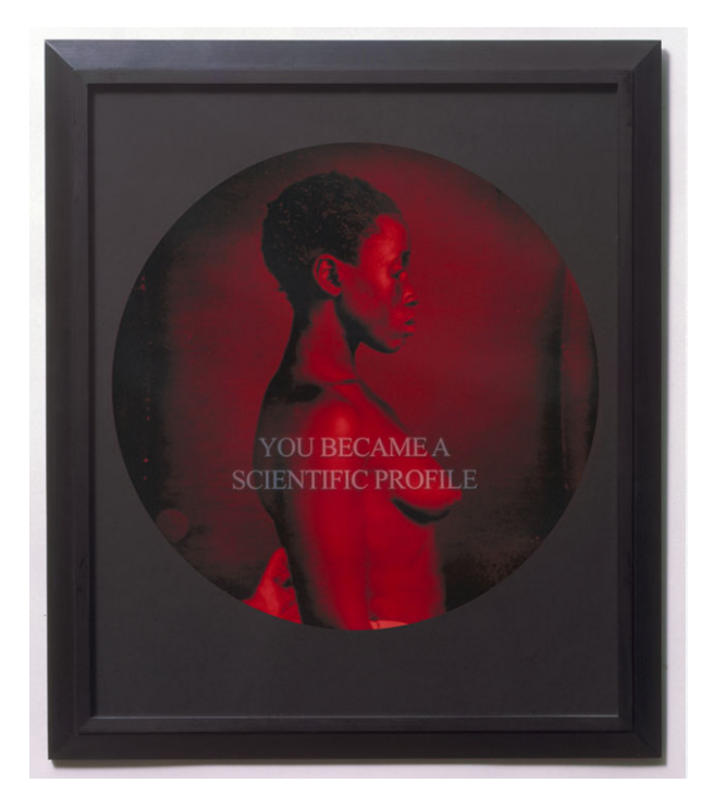
Figure 6 Carrie Mae Weems, You Became a Scientific Profile, 1995–96, C-print with sandblasted text on glass 26 1/2 x 22 3/4 inches. ©Carrie Mae Weems. Courtesy of the artist and Jack Shainman Gallery, New York. [Colour figure can be viewed at wileyonlinelibrary.com].

shame and humiliation can both refer to an internal feeling, humiliation can also refer to the external act of the other that produces shame in the subject. The humiliating physical and psychological abuse of slavery, including the objectification of these four individuals before the camera, invokes shame visible on their faces. In From Here I Saw What Happened ... much of the worst humiliation in the series is done to women's bodies, showing Weems is concerned primarily—though not exclusively—with the multiple jeopardy of black female shame. In the original daguerreotypes, women are socially and sexually debased and their womanhood is targeted specifically, for example, by forcibly exposing breasts (Agassiz, in fact, had an explicit interest in the breasts) (Raymond 2015, 37). King points out that in addition to enduring the same physical demands and punishments as black men under slavery, women suffered gender-specific abuses, namely, institutionalized sexual slavery, rape, and the use of their reproductive and child-rearing capacities as "capital" in a slave economy (King 1988, 47). The issue of black female shame is addressed in other images from the series as well.