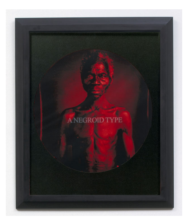
Figure 7 Carrie Mae Weems, A Negroid Type, 1995–96, C-print with sandblasted text on glass 26 1/2 x 22 3/4 inches. [Colour figure can be viewed at wileyonlinelibrary.com].

and underscores Wurmser's claim that "the eye is the organ of shame par excellence" (Wurmser 1987, 67). Weems points out that these appropriated images in their original context were meant "to undercut the humanity of Africans and African-Americans"; when looking at the photographs we see "how white America saw itself in relation to the black subject" (Weems, quoted in Willis 2012, 33, 35). This idea is particularly significant because the daguerreotype itself is a mirrored plate; reflected over the image, the contemporary white viewer would have literally seen himself in relation to the black subject. Presenting the daguerreotypes now out of their original context, Weems asks the audience reflected in the glass over each image to look at these images again, seeing themselves in relation to these black subjects. As Delmez writes, "through the act of performance, with our own bodies, we are allowed to experience and connect the historical past to the present—to the now, to the moment. By inhabiting the moment, we live the experience; we stand in the shadows of others and come to know firsthand what is often only imagined, lost, forgotten" (Delmez 2012, 9).