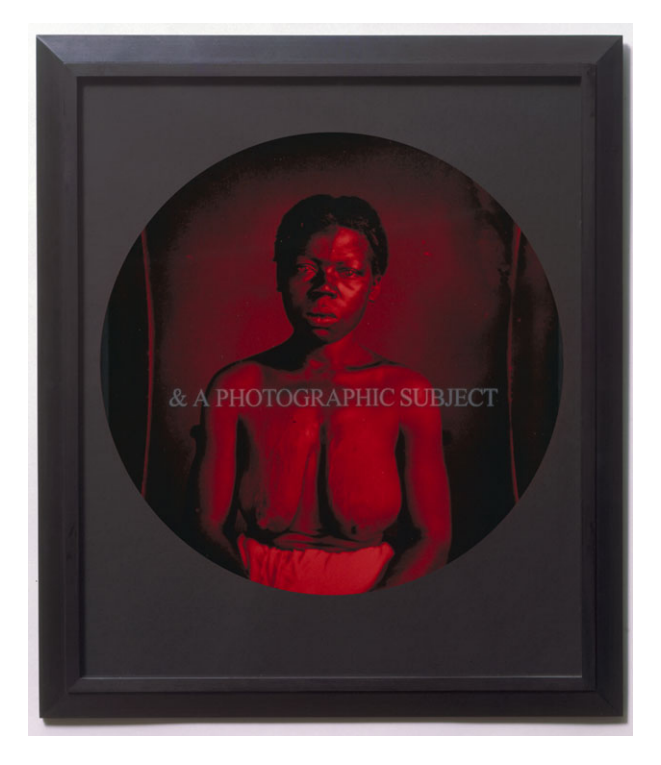
Figure 9 Carrie Mae Weems & a Photographic Subject, 1995–96, C-print with sandblasted text on glass 26 1/2 x 22 3/4 inches. [Colour figure can be viewed at wileyonlinelibrary.com].

audience. "You" can speak to any viewer who identifies with the history of the black Americans depicted, but it also calls on all viewers to empathize with the shame and humiliation of these four individuals. As the viewer reads the text and sees her own body reflected in the glass and superimposed over a fellow person, the work poignantly asks, "What if this were you?" Weems said this is "a strategy I hope gives another level of humanity and another level of dignity that was originally missing in the photograph," and she has "the hope that in the end our mutual humanity will be understood and raised" (Weems 2010, n.p.).