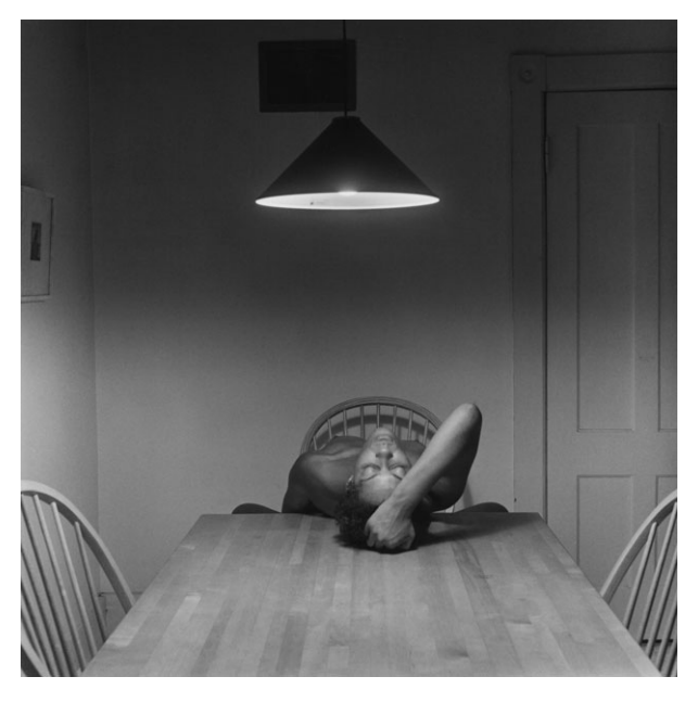
Figure 4 Carrie Mae Weems, Untitled (Nude), 1990, silver print, 28 1/4 x 28 1/4 inches. 28 15/16 x 28 15/16 x 1 1/2 inches framed ©Carrie Mae Weems. Courtesy of the artist and Jack Shainman Gallery, New York.

eye that is always looking and looking again to see the other anew with the goal of creating "an ethics of love in order to avoid falling back into systems of domination, imperialism, sexism, racism and classism.... This process of loving, but with critical interpretation, opens up the possibility of working-through rather than merely repeating the blind spots of domination" (Oliver 2001, 209-10, 218). Oliver's loving eye contrasts with Lacan's model of vision in "The Mirror Stage," which had hitherto been foundational in theories of subjectivity. On Lacan's analysis, the child's subjectivity—which is developed in the visual sphere by looking in the mirror—is split and alienated from the moment of its inception because he identifies with a specular other, exterior to himself, and a mere fragment of his whole image and whole being (Lacan 1949/1977, 1-7).<sup>2</sup> Using herself as a muse, Weems constitutes herself as a subject before the mirror, but in a way counter to Lacan's description. Looking with a loving eye, the muse establishes a correcting mirror to reimagine the self. Oliver's work, like Weems's art, refutes Lacan's assertion that the mirroring gaze is necessarily alienating; in fact Oliver argues that an alienating gaze does not constitute subjectivity, but rather undermines it.