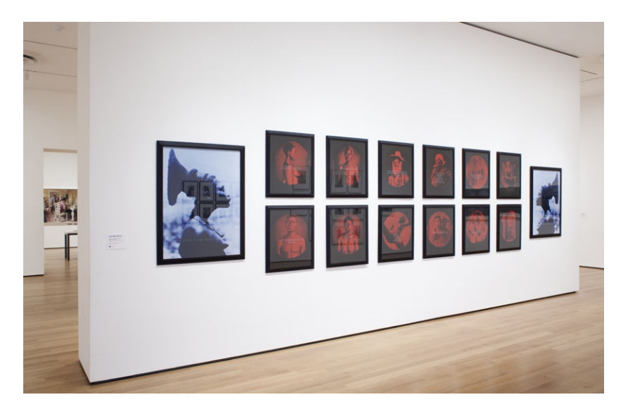
Figure 5 Carrie Mae Weems, Installation view of the exhibition "Pictures by Women: A History of Modern Photography (Part 2)" May 7, 2010–April 18, 2011. The Museum of Modern Art, New York, NY, USA. [Colour figure can be viewed at wileyonlinelibrary.com].

The work bears witness to the subjectivity of blacks who had been humiliated in American history, through a series of fourteen appropriated photographs enlarged, framed in black, and set behind glass with text sandblasted into the surface. The first and last pictures are the same: profile views of an African woman (Nobosodrou, a Mangbetu woman in the Belgian Congo, photographed by Leon Poirier and George Specht during the French Citroen Expedition through Africa, March 1925) and tinted blue by Weems. Etched on the glass of the first woman in blue are the words "From here I saw what happened" and on the last woman "and I cried." The last woman is flipped horizontally so that the mirror images of this woman bookend and observe the remainder of the American photographs between them. Following the line of their gazes we see the cause of their sorrow in a series of pictures, roughly the same size and format as the blue ones but now colored red. The red pictures come from a variety of sources, but the first four [fig. 6, fig. 7, fig. 8, and fig. 9] are from daguerreotypes taken in 1850 on behalf of Harvard natural scientist Louis Agassiz, who was looking for "proof" that African blacks and European whites were distinct species created separately (Wallis 1995, 40). They show men and women who were enslaved on a South Carolina plantation; photographed against their will, they were shot from the waist up, bared and treated as mere property or specimens. Although