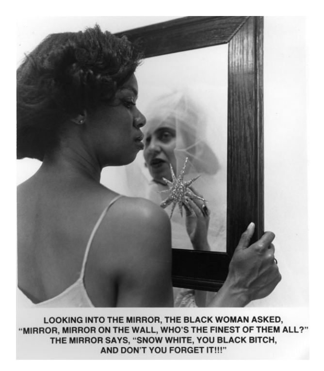
Figure 2 Carrie Mae Weems, Mirror Mirror, 1987–88, gelatin silver print, 24 x 20 inches. 25 x 21 x 1 1/2 inches framed ©Carrie Mae Weems. Courtesy of the artist and Jack Shaiman Gallery, New York

In the picture a black woman holds a wooden frame in front of her as if holding up a mirror. Her head is turned away, and her downcast eyes do not meet the gaze of the reflection. She looks embarrassed. In contrast to her black skin is the lighter skin of a fairytale woman on the other side of the frame, wearing a white tulle veil on her head and holding a sparkling star-headed wand. Her contemptuous gaze bores into the woman's face. Weems's caption printed below this image indicates that this is the artist's retelling of Snow White before the mirror: "Looking into the mirror, the black woman asked, 'Mirror, mirror on the wall, who's the finest of them all?' The mirror says, 'Snow White, you black bitch, and don't you forget it!!!" In this section I argue that this work allegorizes the "doubleness of experience of shame" (Lewis 1987) by representing the internalized shaming gaze of the other with an image of the shamer's face rather than the subject's own as she looks in the mirror. That internalized gaze induces the condition Oliver calls social melancholy.