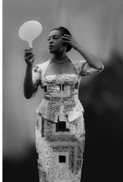
Figure 3 Carrie Mae Weems, I Looked and Looked but Failed to See What so Terrified You (Louisiana Project series), 2003, digital print, 35 3/4 x 23 3/4 inches each 36 1/2 x 24 1/2 x 1 5/8 inches framed. ©Carrie Mae Weems. Courtesy of the artist and Jack Shainman Gallery, New York.